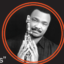
RONNIE LAWS "Friends and Strangers"