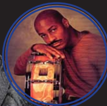
SONNY EMORY Former Drummer for Earth, Wind & Fire